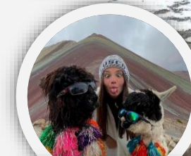
RAINBOW MOUNTAIN. ALT