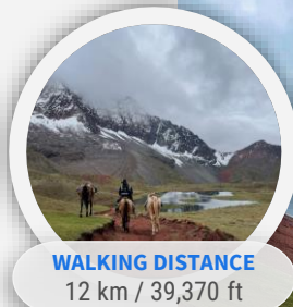
WALKING DISTANCE 12 km / 39,370 ft

We'll descend for 45 minutes to our camp located next to the Surine Qocha Lagoon. Upon your arrival we will welcome you with our happy hour. Later, you'll enjoy dinner before a well-deserved night of rest.