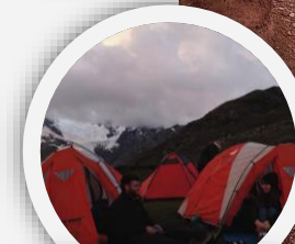
ACCOMMODATION Private Camps