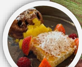
MEALS Breakfast, lunch, dinner