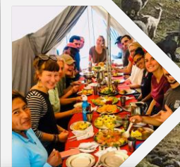
MEALS Breakfast, lunch, dinner