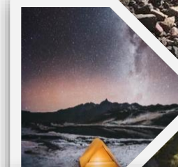
ACCOMMODATION Private Camps