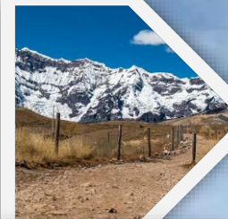
WALKING DISTANCE 17 km / 10.56 mi

Once in the camp, you can serve yourself some hot chocolate or coffee, and then a little later, dinner will be ready. It'll then be time to retire to your bed for some well-earned rest.