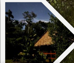
ACCOMMODATION: Paradise Amazon Lodge