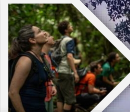
WALKING DISTANCE: 1 km Walking

Nocturnal Activities are available each night. These range from nocturnal walks, talks on different topics and Cayman spotting when conditions are optional.