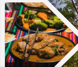
MEALS lunch, dinner.